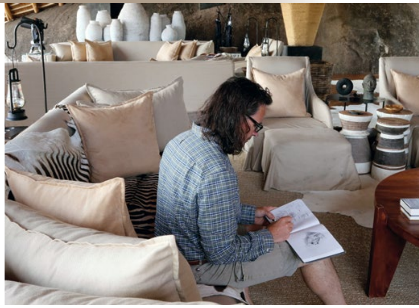
Lounge, Mwiba Lodge, Serengeti, Tanzania

In 2019, the Nevada Art Museum will feature Banovich in a one-man exhibition titled The King of Beasts: A Study of the African Lion. As an internationally recognized artist